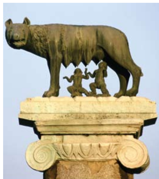
Capitoline Wolf with Remus and Romulus