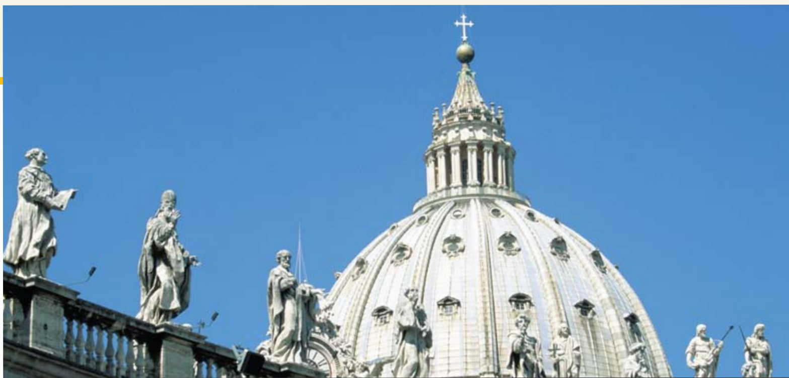
Domed rooftop of St. Peter's Basilica in Vatican City

Pompeii Ostia Antica (program extension) Caracalla Baths, Catacombs, and Appian Way (program extension)