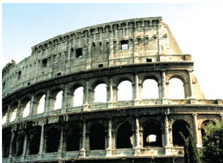
The Colosseum, once capable of holding 55,000 spectators

Coach transfer to airport for flight home.