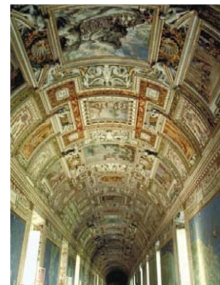
Ornate ceiling in the Vatican Museums