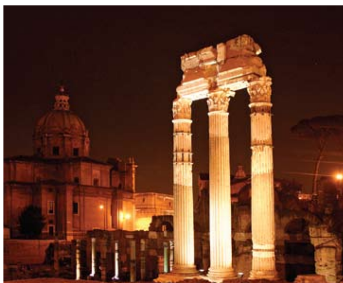
Nighttime view of the ancient Roman Forum

Get ready to roll up your sleeves and prepare your own pizza . Stretch out the dough, add fresh Italian toppings, and bake them in wood-fuelled ovens.