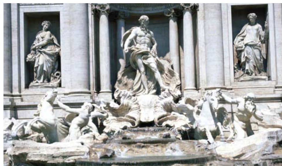
Neptune taming the waters of the Trevi Fountain

Note: This itinerary may be modified depending on your travel dates, arrival and departure times, national holidays, and hours of operation in the host country. Prices vary depending on departure city and duration of program.