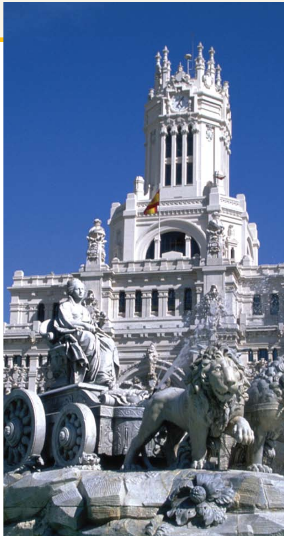
Madrid's renowned Plaza de Cibeles