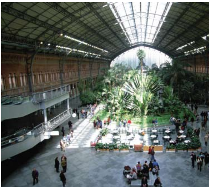
Atocha Station features a lavish indoor garden in addition to transportation services

Note: This itinerary may be modified depending on your travel dates, arrival and departure times, national holidays, and hours of operation in the host country. Prices vary depending on departure city and duration of program.