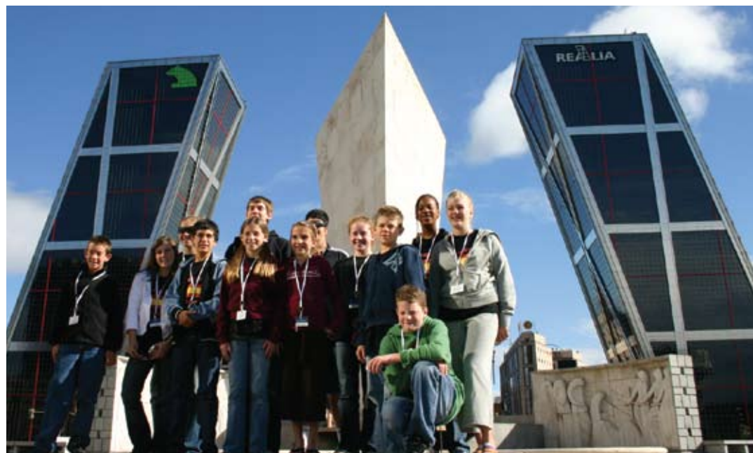
Students pose in front of the modern business district