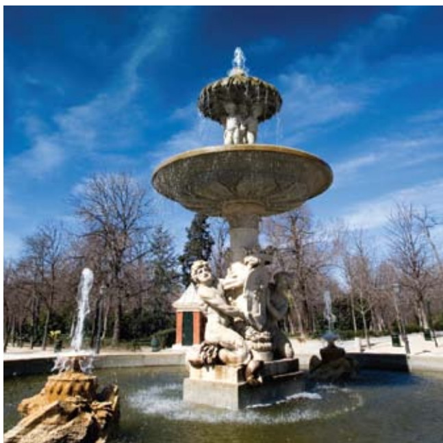
Fountain in Madrid's Retiro Park

In the afternoon, visit Museu Picasso and gain some insight into the formative years of Picasso through more than 3,500 pieces of his work.